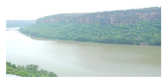
Fig. 1: Picturesque view of Chambal river.

The study is conducted in the vicinity of a thermal power of plant in Kota city. The city is situated in the south of Rajasthan. It is located at 25°10'57.1" N latitude and 75°50'20.7" E longitude in south eastern part of Rajasthan (Geographic coordinates of India). Kota experiences extremes of temperature during summer and winter seasons. The thermal power plant is located on the left bank of Chambal river. The total installed capacity of Kota Thermal Power Plant is 1240 MW and was first commissioned in 1983. The plant is spread in an area of 204 hectares. The thermal power plant uses water from nearby Chambal river for the cooling purpose. The heated water is discharged back into the river (http:// www.rvunl.com). Chambal river is the longest freshwater river of Rajasthan state that flows throughout the year. It originates from Janapao Hills of Vindhya range in south of Mhow town of Madhya Pradesh and is a tributary of Yamuna river (World Water Database).